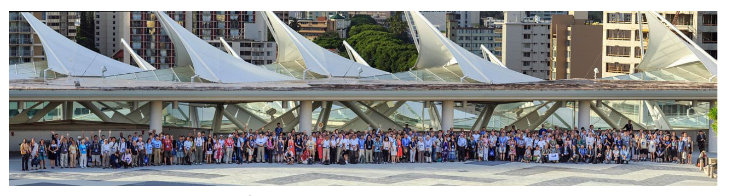
IAU General Assembly Hawaii August 2015